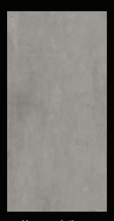
Hammered: 12 mm