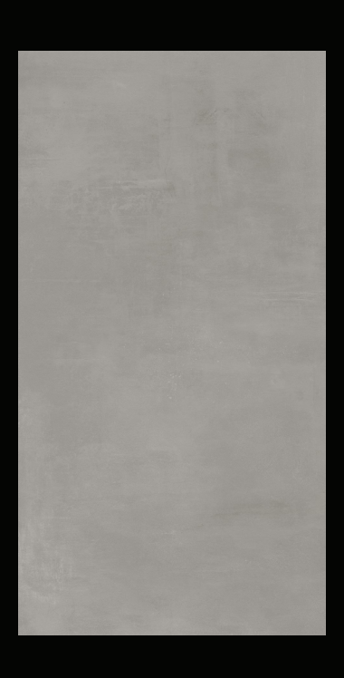
Available in 4 patterns Hammered: 6 mm