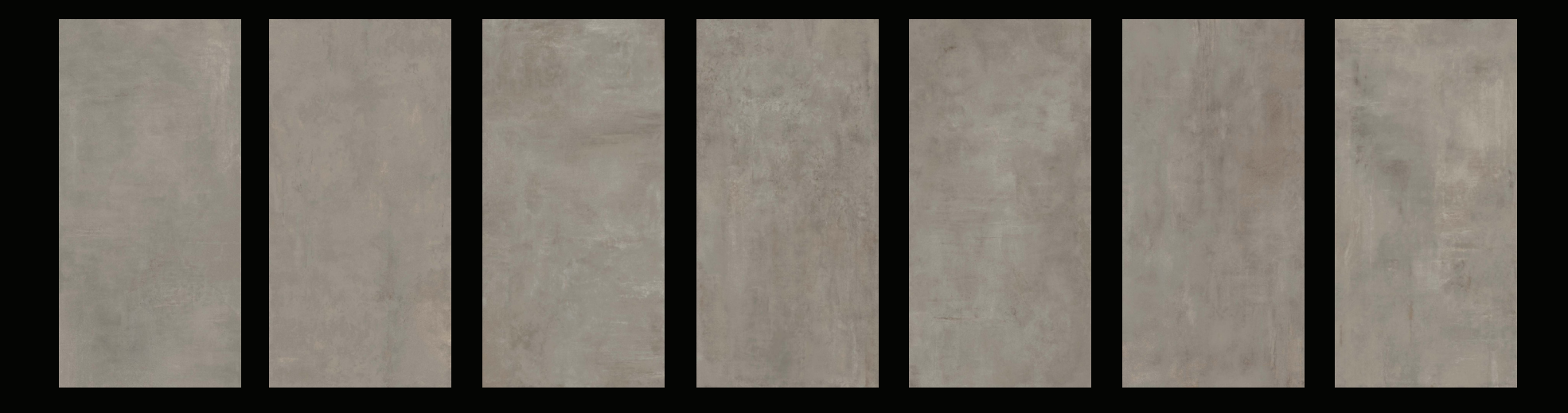
Available in 7 patterns Matte: 9 mm